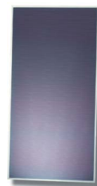
First Solar Modules