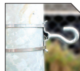
Band Lock with J Hook