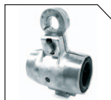
ABC Suspension Clamp