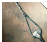
Guy Grip Dead-end