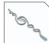
Plastic Distribution Ties