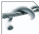
Spiral Vibration Damper