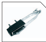
Strain Clamp for LV ABC