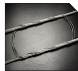
Helical Rod Spacer