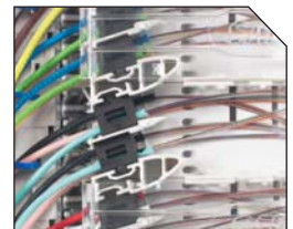
Buffer Tube Storage