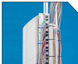
Fibre Trays Management