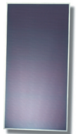
First Solar Modules